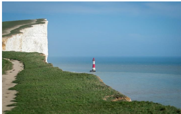
Beachy Head Lighthouse

For the latest information visit: http://www.droitwichartsnetwork.org/ on Facebook https://www.facebook.com/groups/208713719174369/ e-mail tina.watkins.ntlworld@gmail.com