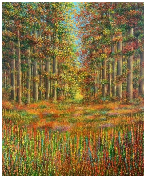
Into the Woods

Michelle Doidge sent in these excellent images and says “ I include a selection of images from the Colour of Light”, exhibition. ”